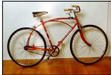
#432 Malvern Star, Skidstar, Australia, 1971. $500