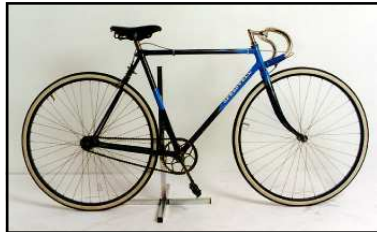
#502 Speedwell 1936 $500