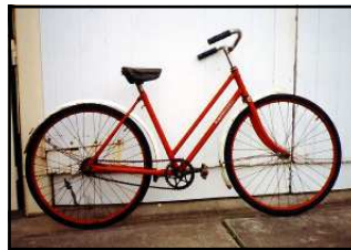
#636 Malvern Star child's 24" Australia 1940's. $200