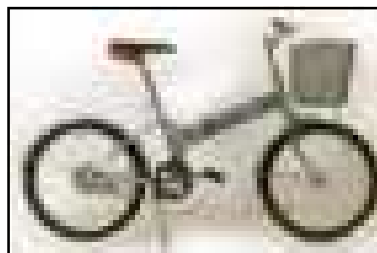
#962 Giant Halfway 20" folder, single speed, from China 2002. $300