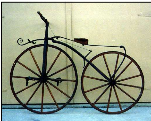
#154 Boneshaker, 33" & 29" wheels, built in England 1869. Excellent condition. $10,000