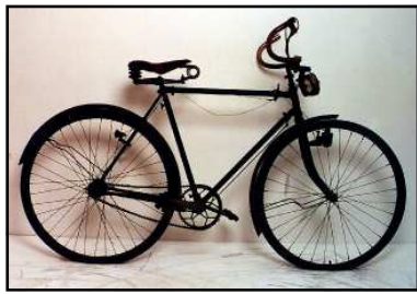
#506 Malvern Star '1 star' model, 28" Made in Melbourne Australia 1920. $1,000