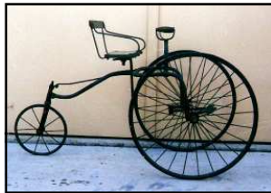
#152 Child's treadle tricycle 25" front wheels, c1880 England. $1,500