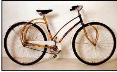
#293 Malvern Star, Coronation Model, Australia, 1954. $1,000