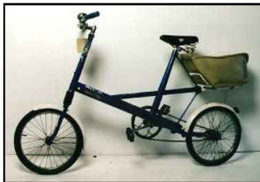
#325 Moulton 1965 England 16". $200