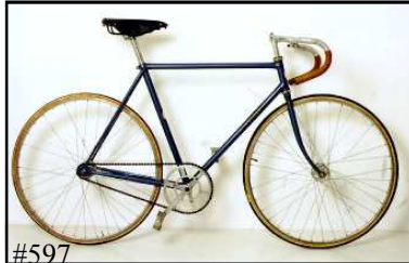
#597 Tollis 700c, Australia 1965 . Raced by Canberra rider, Reg Toovey. $500