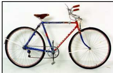
#898 Malvern Star '2 star' model, 28", Melbourne Australia, 1930's. $600