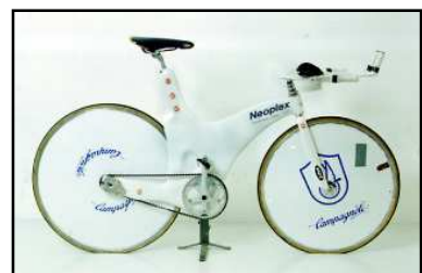
#910 Super Roo, designed for the Aus- tralian team to race in the Olym- pics by Melbourne Institute of Technology, Australia, 1996. $1,500