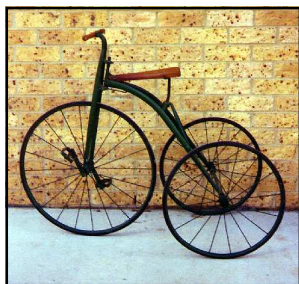
#155 Child's tricycle, 25" solid tyred front wheel c 1900, UK. $500