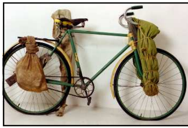
#548 Speedwell 28", as used by outback shearers, Sydney Australia 1934 . $500