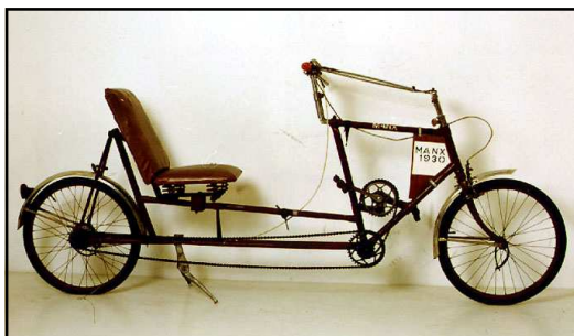
#730 Manx 20", early original recumbent. Patent applied for in 1937 Australia. $1,200