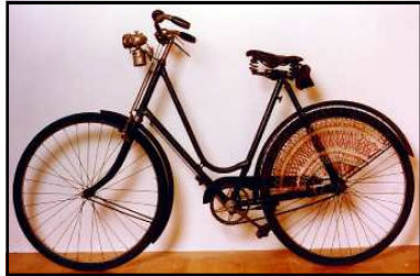
#138 Halford 28". English 1927. Has small wire basket on the front, tool pouch, bell, tyres are OK, dress net has tears. $1,000