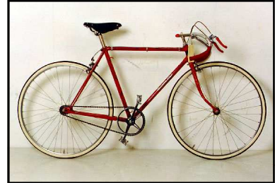
#703 Malvern Star '5 star' model, 27" racer, Australia, 1940. Restored immaculately by Warren Meade of Victoria.. $2,000