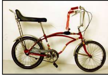
#728 Malvern Star dragstar 1975. $500