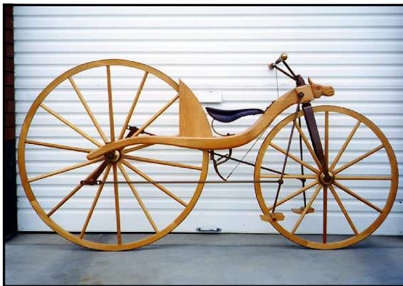
#500 Macmillan. A wooden bicycle with lever driven pedals was said to be built by Kirkpatrick Macmillan in 1840. This reproduction was built by Simon Ramsay of Canberra to exact blueprint specifications. There is no existing original Macmillan in the world. $15,000