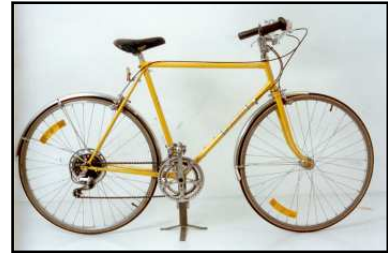
#912 Spokesman Cycles, Canberra, 1980. $500