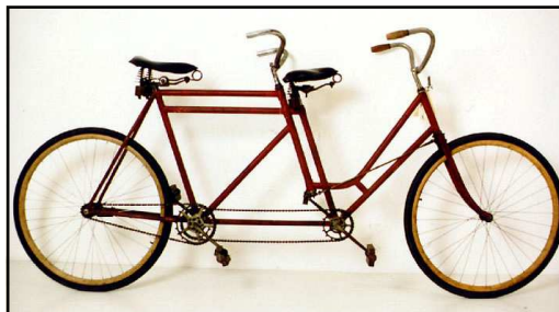
#701 Double steerer tandem 28", 250cm long, 1890, USA. $5,000