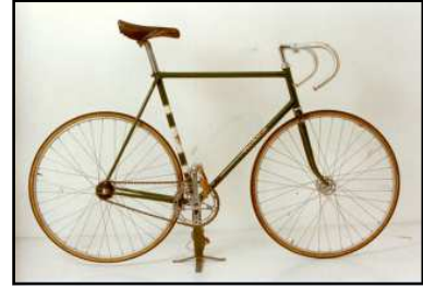
#914 Pegasus, Made in Canberra, 1980. $500