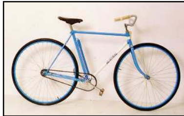
#745 Austral 28" Victoria 1935. $500