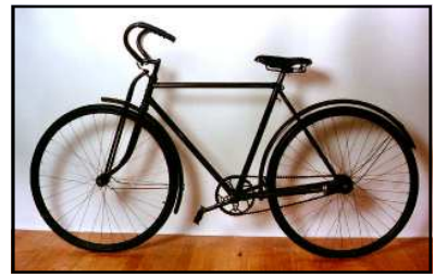
#56 Hartley 28" 1939. $1,000